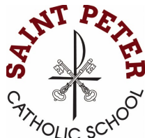
New Logo (started in 24-25)