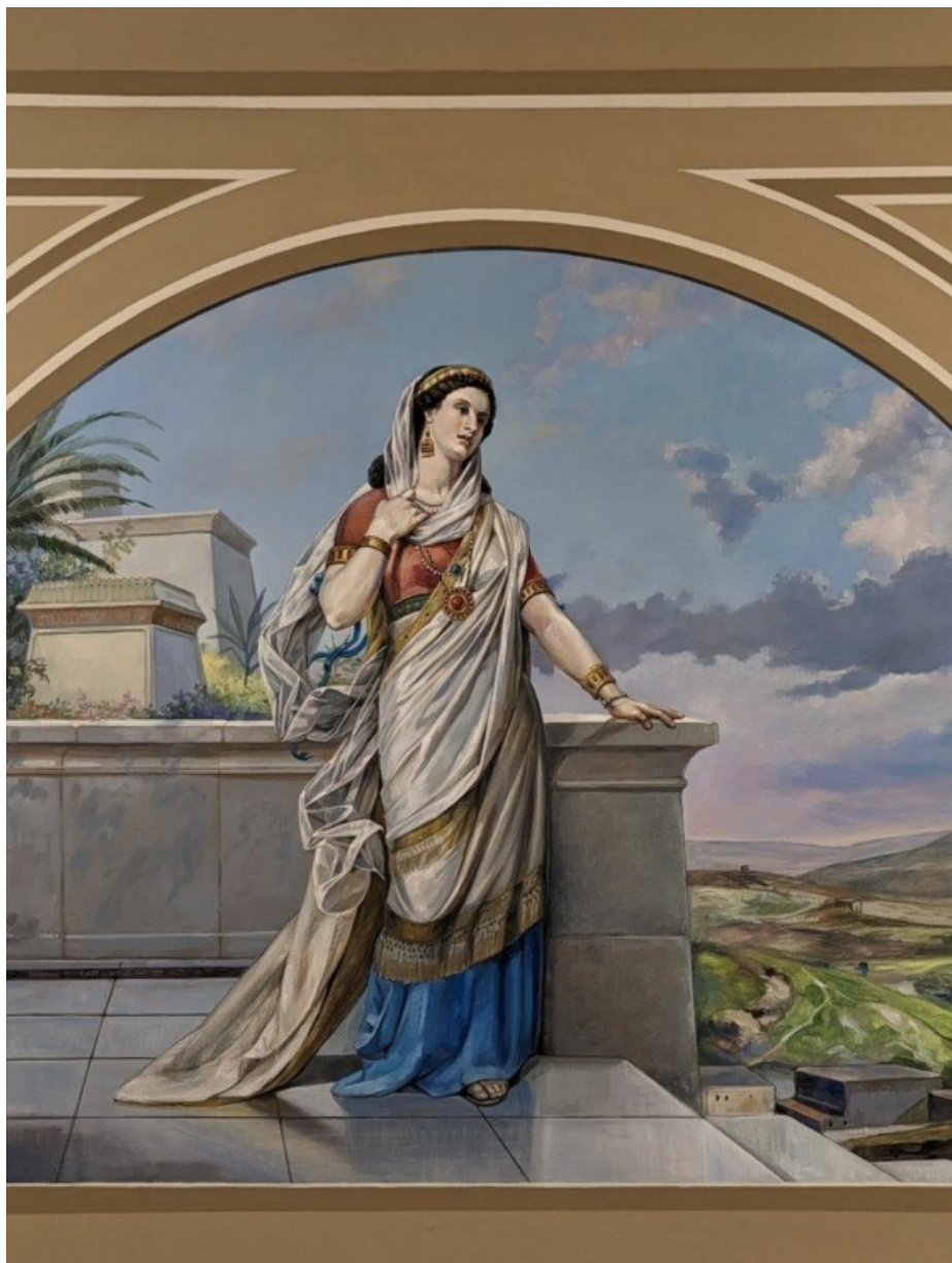
Above: Renovation progress of the mural of Queen Ester.