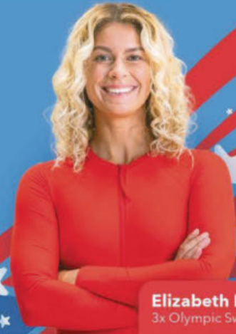
Elizabeth Beisel 3x Olympic Swimmer & Lifesaver