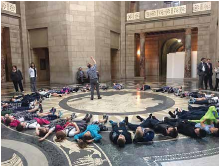
Visiting the state capitol