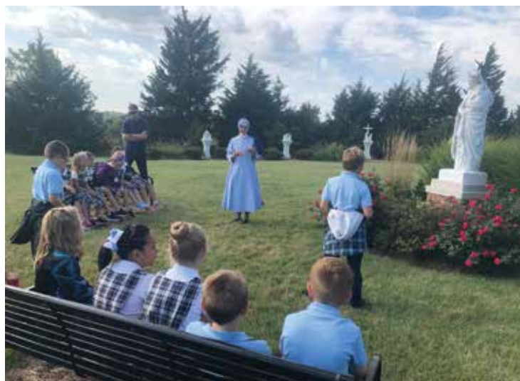
Visiting the Villa Regina Mother House