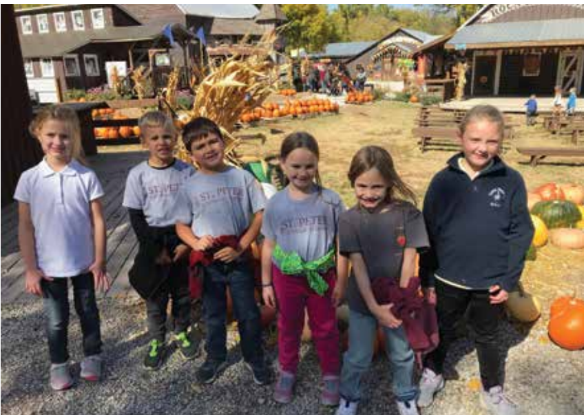
Visiting the Roca Berry Farm

Our students at St. Peter Catholic School undoubtedly receive an outstanding classroom education grounded in our Catholic faith. But there is much to be learned beyond the classroom. That's why the St. Peter Catholic School Field Trip program makes sure our students enjoy educational experiences and all the advantages they bring.