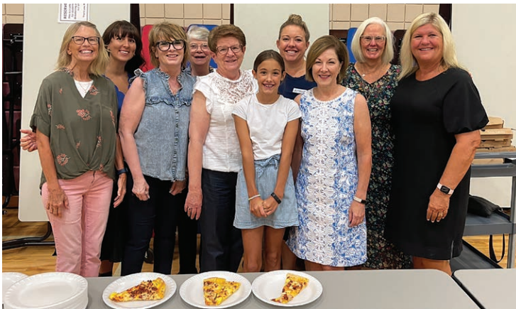
This ministry is a great way to get involved.