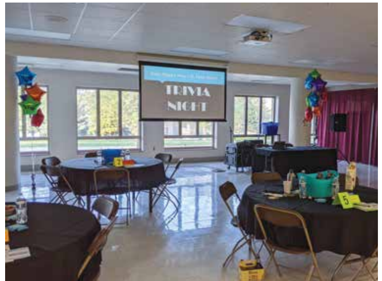
The Holy Happy Hour will continue with various games quarterly on Friday nights in the Bishop Vasa Hall.