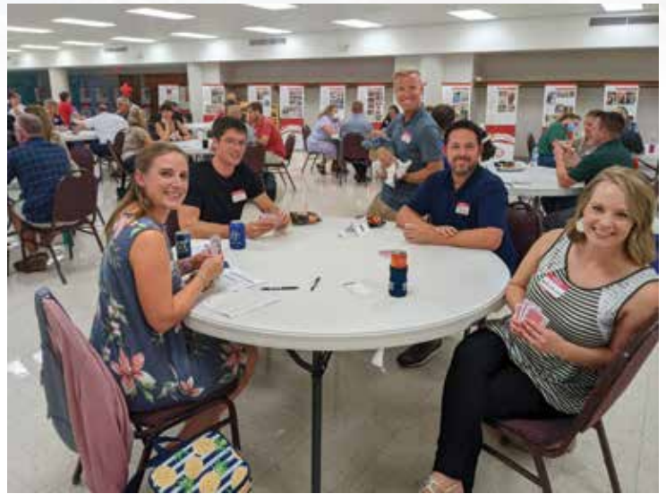
This ministry began with an April 2021 Trivia Night that was attended by more than 150 people.