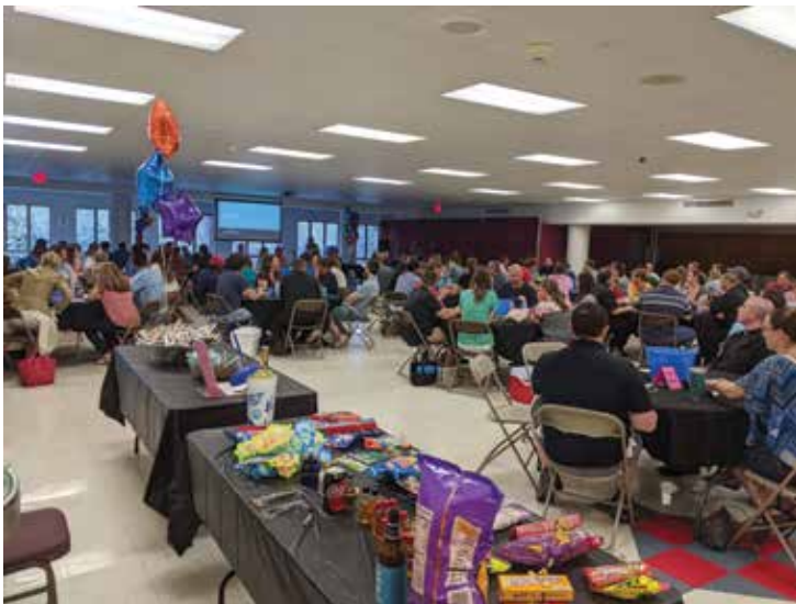
Parishioners and community members gathered for Trivia Night in 2021.